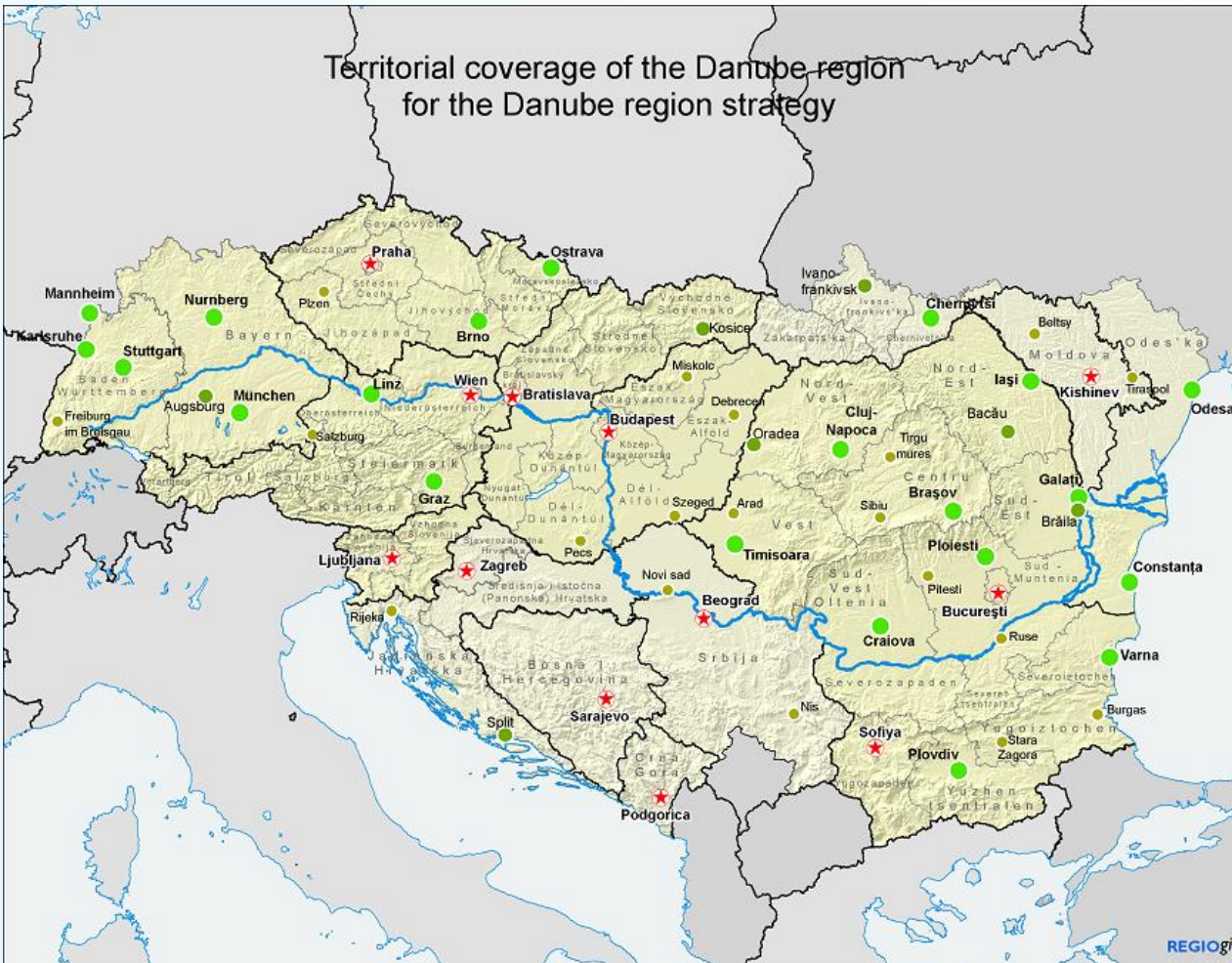
Territorial coverage of the Danube region for the Danube region strategy